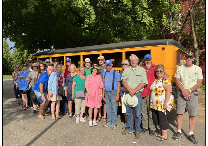
Gilmore Model A Days, photo by Irma Sund.

The drive-out will depart from the parking lot located across the street from the Crown Point post office at 8:30 am.