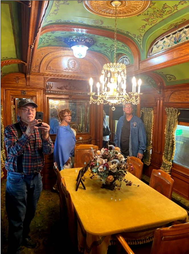
Many took pictures in the Flagler coach, this one in the dining room