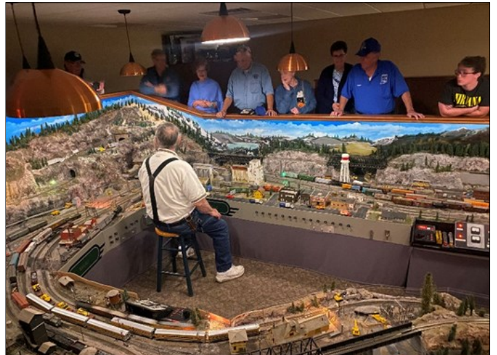
View of the Monon Museum HO train layout

Shifting to the main portion of the museum, Harold shared stories about the Abraham Lincoln funeral train, which came through the town of Monon on its way to Springfield, and the origin of the Monon name and logo, among several other tales.