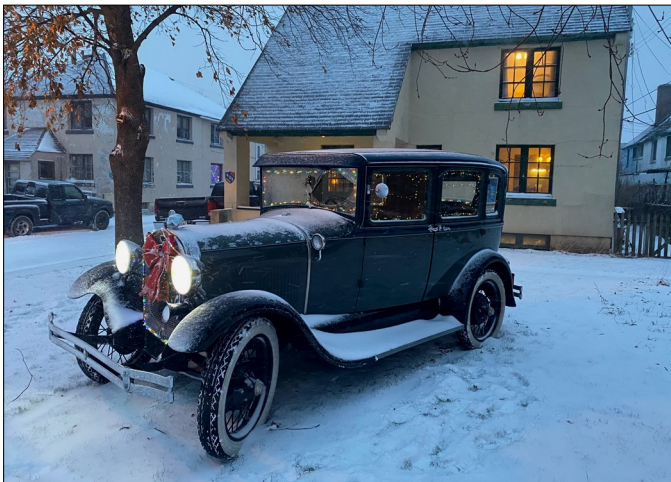
Post-Holiday and parade-festive, and pretty enough to be a Christmas card.