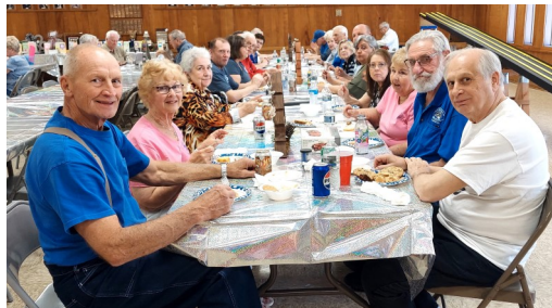
Highland Club had 30 members attending the Calumet Soup Day. What a turn out!

We have once again been invited to Pullman Railroad Days. Our June drive-out will be Saturday June 1, where we will be going to Pullman. We will be able to view 3 different train cars, all privately owned. The first one is the 1950 Pullman Sleeper-Observation Blue Ridge Club, the 2 nd is a 1934 Sleeper-Lounge Dover Harbor, and the 3 rd is a 1957 Art Deco Beauty Hollywood Beach. As usual there will be tours, food, music, and fun. Details will be given at our May meeting, sign-up then. Dan Dieck